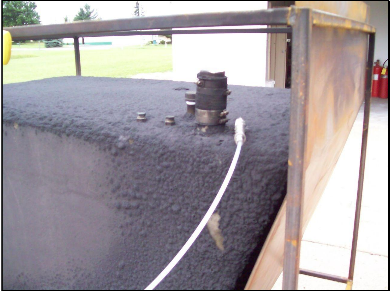
33.20.6 Fuel Tank Fire Post-Test

THIS REPORT SHALL NOT BE REPRODUCED, EXCEPT IN FULL, WITHOUT THE APPROVAL OF THE TECHNICAL MANAGER THE RESULTS OF THIS REPORT RELATE ONLY TO THE ITEMS TESTED Do Not Reproduce in Black and White